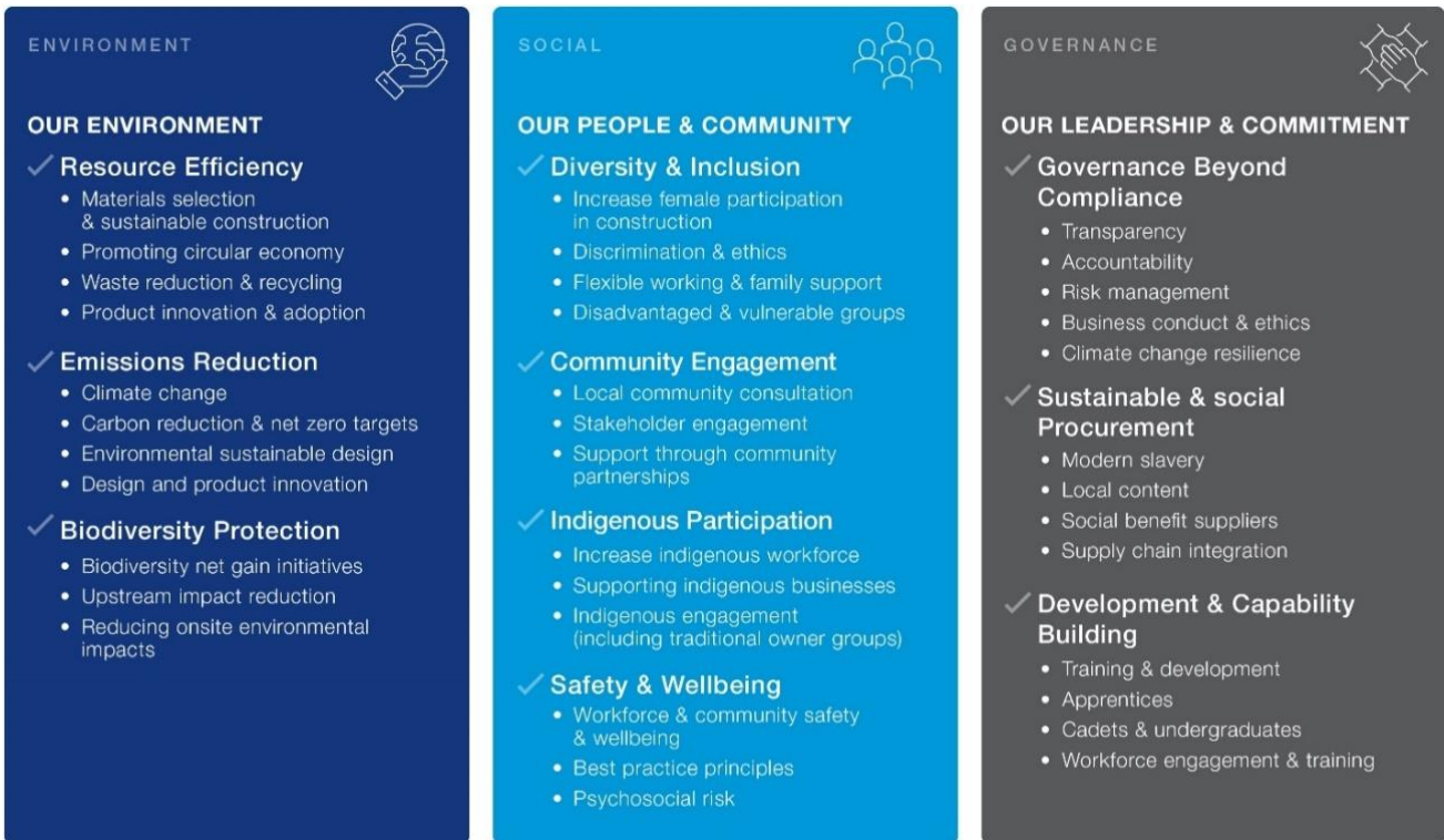
Figure 2 – List of operational sub-topics under each key focus topic

The focus topics are made up of a sub-topics that help align our collective effort across operations. These are reviewed on an annual basis by the Sustainability Committee to reflect our company and client needs and industry best practice.