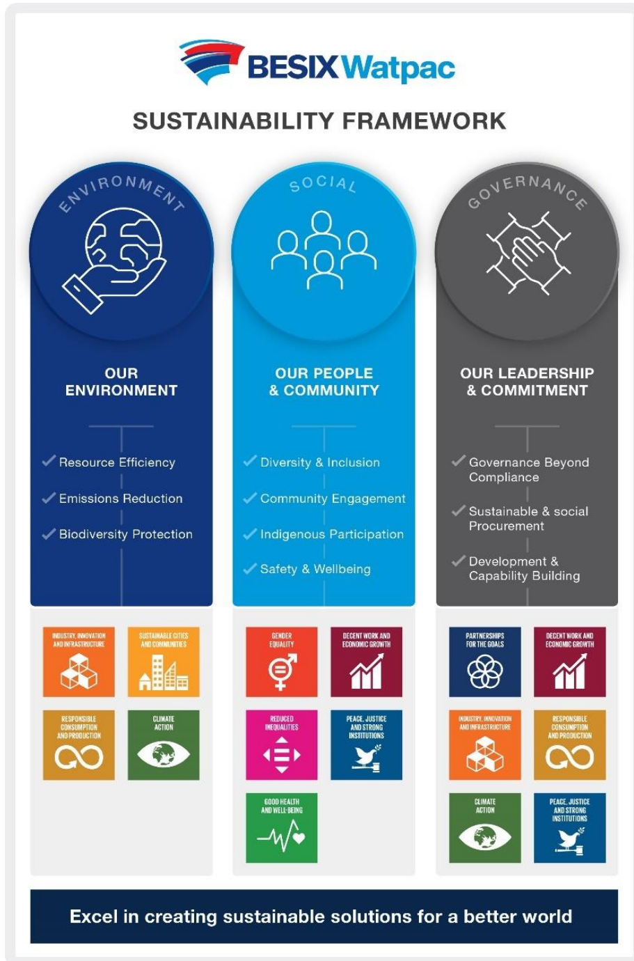
Figure 1 – Sustainability Framework detailing our key focus topics and UN SDGs

The BESIX Watpac Sustainability Framework provides a robust approach to delivering our National Sustainability Policy objectives and creates the foundations for our Sustainability Strategy. It's based on the environment, social and governance pillars also known as Our Environment, Our People and Community and Our Leadership and Commitment. Each pillar details key focus topics material to BESIX Watpac and our stakeholders with alignment to our ten selected United Nations Sustainable Development Goals. These focus topics are evolving and guide the development of company targets and project actions detailed in our Sustainability Strategy.