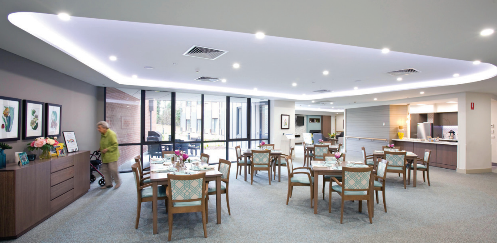
^ Baptcare Strathalan Residential Aged Care Facility Macleod, VIC