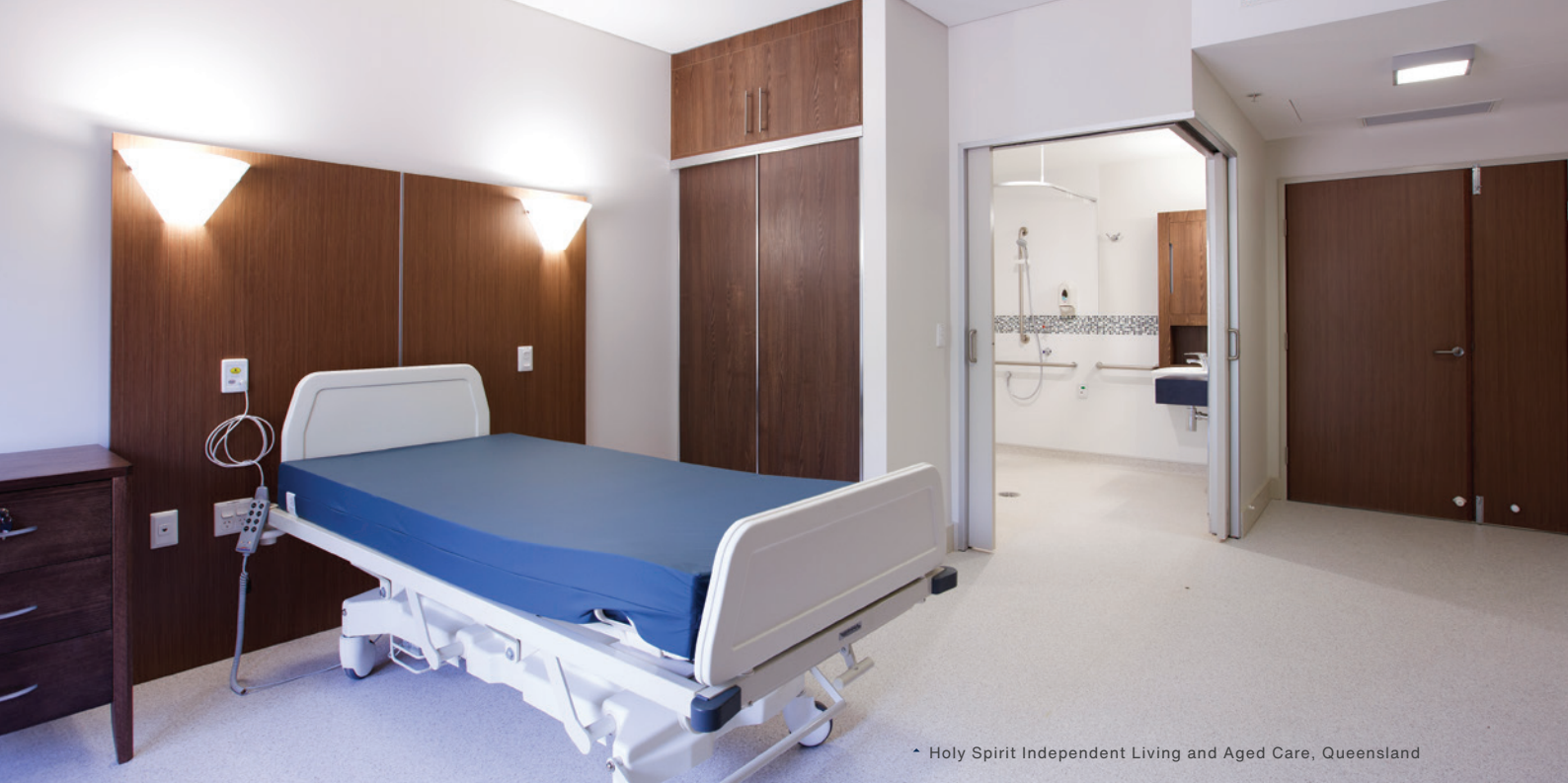
▲ Holy Spirit Independent Living and Aged Care, Queensland