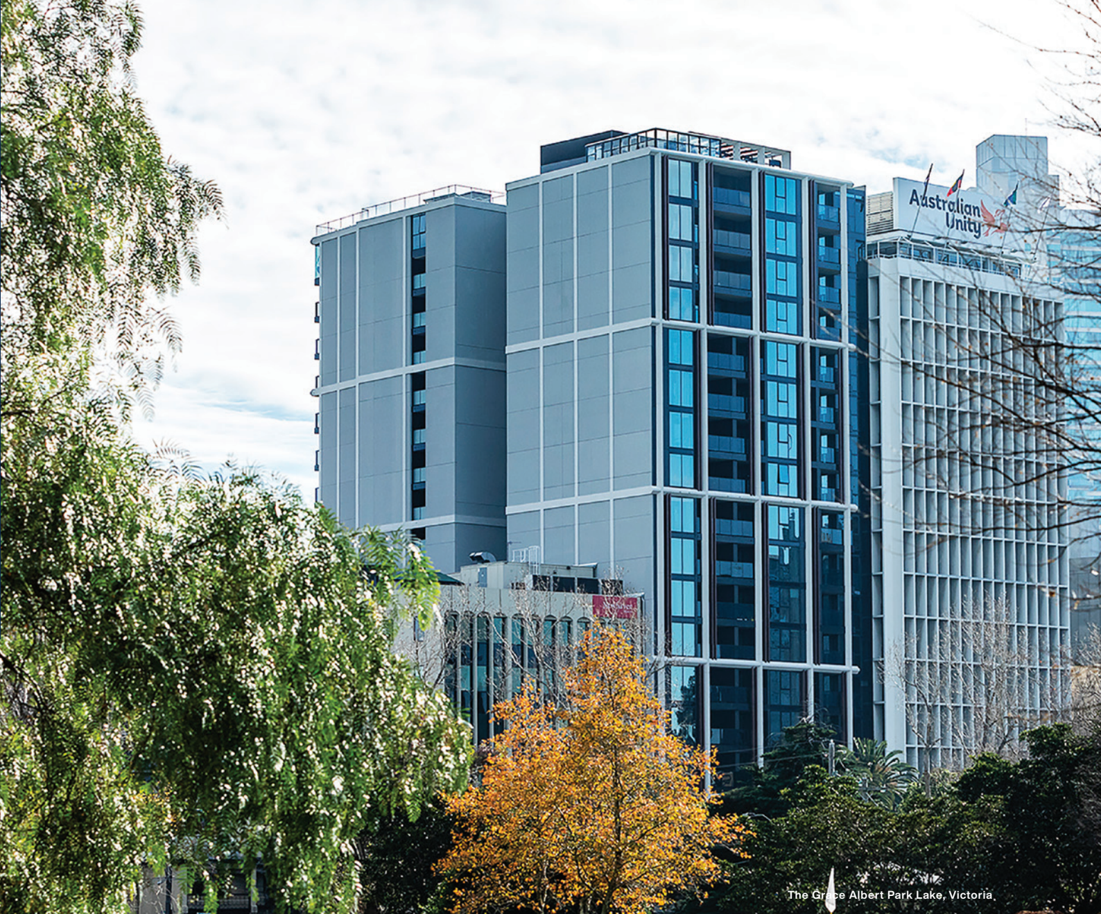
The Grange Albert Park Lake, Victoria